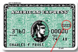
Card ID #

Prices subject to change without notice.