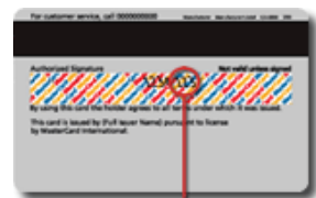
Card ID #