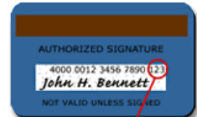
Card ID #