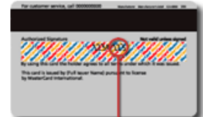
Card ID #